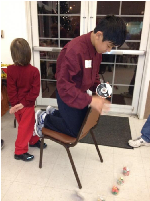
There were games for the kids