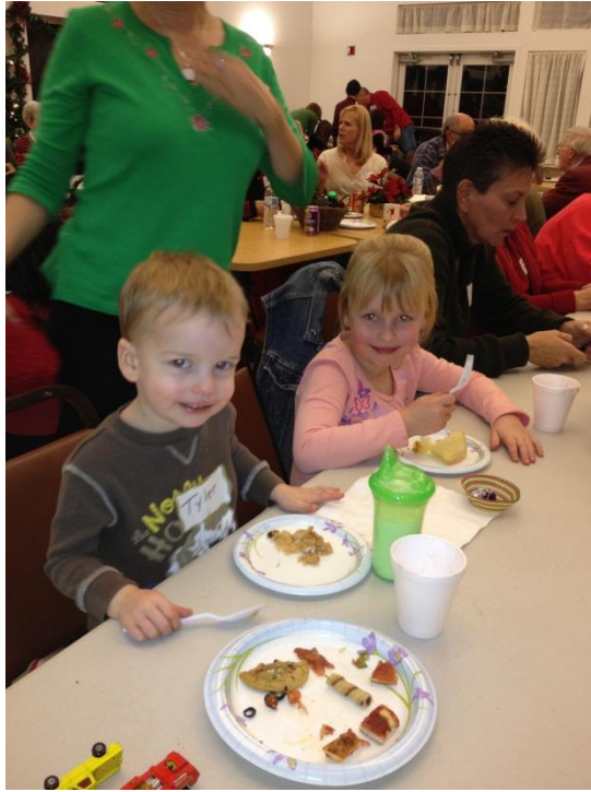
Everyone enjoyed the pizza and desserts.